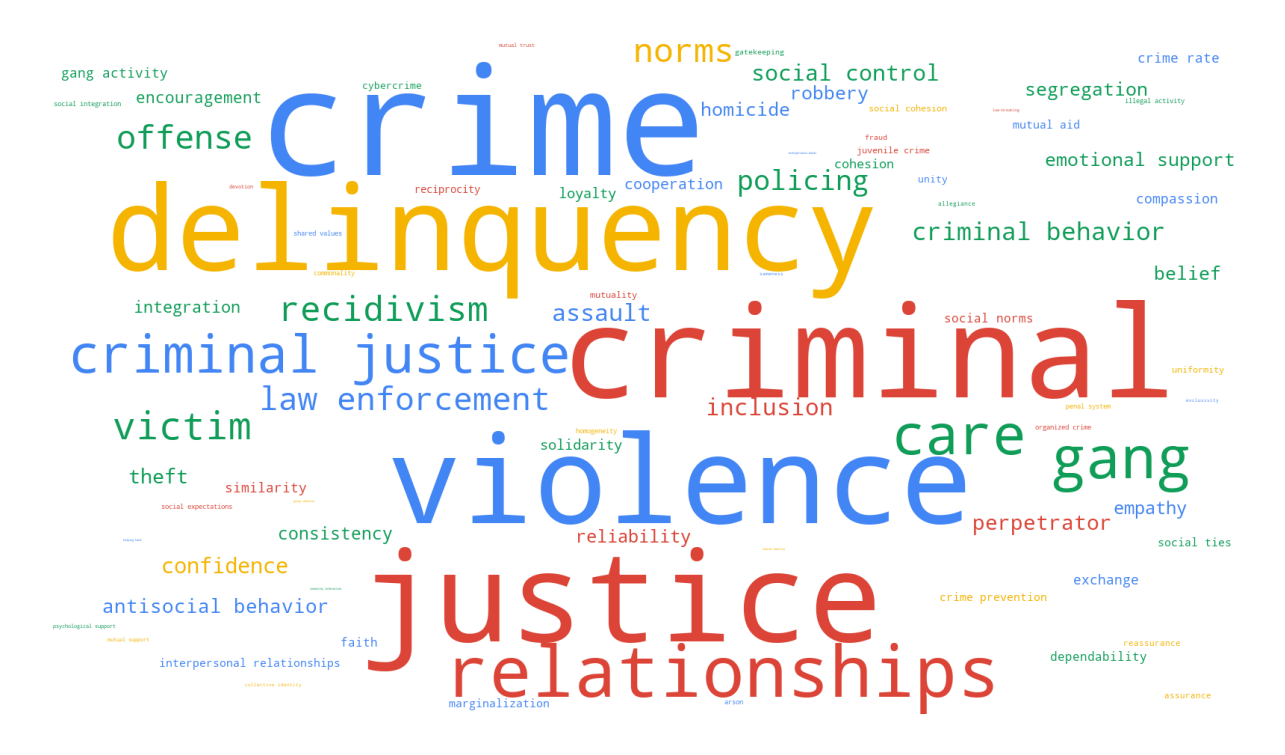
Figure 1: Word cloud

reciprocity and social cohesion terms indicated general usage but less attention to specific subcomponents. High usage frequencies of terms related to emotional support and local interactions highlighted the dynamic nature of social capital and the importance of community interactions. The diversity in terminology related to criminal behaviors indicated the multidimensional theoretical and practical approaches applied in the theses.